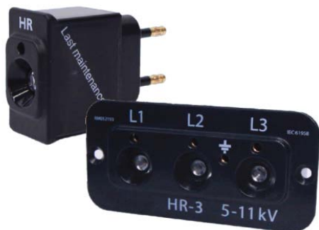
The FT-2 is compatible with HR-2 & HR-3 voltage detectors.

Our phase comparator is IP2XC certified. The FT-2 is compatible with the following voltage detectors: HR-2 (DF-2 and DI-2 cubicles) and HR-3 (DR-6, DF-3 and DW-2 cubicles).